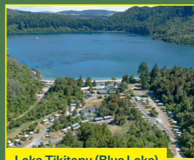
Lake Tikitapu (Blue Lake)