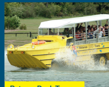
Rotorua Duck Tours